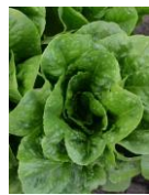
LETTUCE Verte d'Hiver 500 seeds £1.80 Sow: Jun - Sept