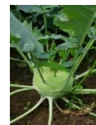
KOHL RABI Green Vienna 300 seeds £1.80 Sow: Jun - Sept