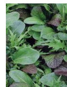
MESCLUN/MIX'T Oriental 500 seeds £1.80 Sow: Jul - Sept