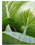
CHINESE MUSTARD Komatsuna 200 seeds £1.80 Sow: Jul - Sept