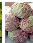
RADICCHIO Variegata di Chioggia 300 seeds £1.80 Sow: Jun - Sept