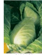
CABBAGE Durham Early 200 seeds £1.80 Sow: Jul - Sept