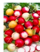
RADISH (Summer) Rainbow Mix't 300 seeds £1.80 Sow: Jun - Sept