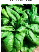
SPINACH Viroflay 300 seeds £1.80 Sow: Aug - Sept