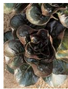
LETTUCE Rougette de Montpellier 300 seeds £1.80 Sow: Aug - Oct