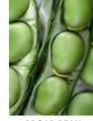
BROAD BEAN Bunyard's Exhibition 30 seeds £1.80 Sow: Oct - Nov