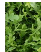
ROCKET Salad 500 seeds £1.80 Sow: Jun - Sept