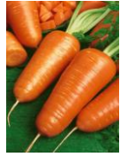
CARROT Chantenay Red-cored 1000 seeds £1.80 Sow: Jul - Aug