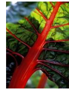
LEAF BEET Ruby 100 seeds £1.90 Sow: Jul - Sept