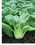
CHINESE LEAVES Pak Choi 200 seeds £1.80 Sow: Jul - Sept