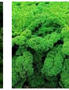
BORECOLE Hungry Gap 200 seeds £1.80 Sow: Jul - Sept