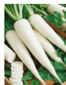
RADISH (Summer) Long White Icicle 350 seeds £1.80 Sow: Jun - Sept