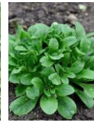
CORN SALAD Large-seeded 300 seeds £1.80 Sow: Jul - Oct