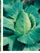
CABBAGE Flower of Spring 200 seeds £1.80 Sow: Jul - Sept