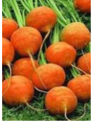
CARROT Paris Market 1000 seeds £1.80 Sow: Jul - Aug