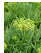
ROCK SAMPHIRE Sow: Aug - Sept 30 seeds £1.95 Sow: Aug - Sept