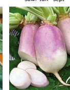
TURNIP Rose de Verdun 300 seeds £1.80 Sow: Jul - Sept