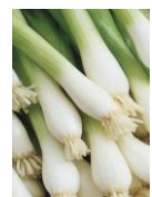
ONION White Lisbon 300 seeds £1.80 Sow: Aug - Sept