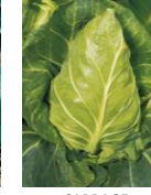
CABBAGE Wheeler's Imperial 200 seeds £1.80 Sow: Jul - Sept