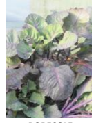
BORECOLE Purple Flanders 200 seeds £1.80 Sow: Jul - Sept