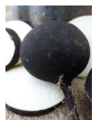
RADISH (Autumn) Black Spanish Round 200 seeds £1.80 Sow: Jul - Aug