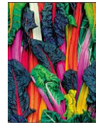
LEAF BEET Rainbow 100 seeds £1.80 Sow: Jul - Sept