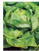
LETTUCE All The Year Round 500 seeds £1.80 Sow: Jun - Sept