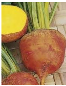
BEETROOT Golden 100 seeds £1.80 Sow: Jul - Sept