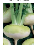
TURNIP Manchester Market 500 seeds £1.80 Sow: Jul - Sept