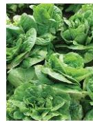
LETTUCE Craquerelle du Midi 500 seeds £1.80 Sow: Aug - Sept