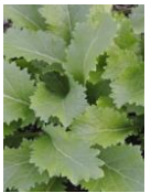
CHINESE MUSTARD Green in Snow 200 seeds £1.80 Sow: Jul - Sept