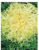
ENDIVE Frisee de Meaux 300 seeds £1.80 Sow: Jun - Sept