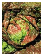
LETTUCE Marvel of the 4 Seasons 500 seeds £1.80 Sow: Jun - Sept