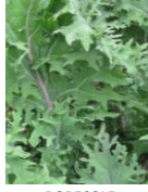
BORECOLE Red Russian 200 seeds £1.80 Sow: Jul - Sept