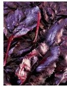
BEETROOT Bulls Blood 100 seeds £1.80 Sow: Jul - Sept