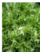
ENDIVE Moss Curled 300 seeds £1.80 Sow: Jun - Sept