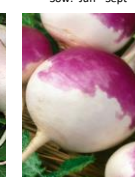
TURNIP Veitch's Red Globe 500 seeds £0.90 Sow: Jul - Sept

If sown in a Greenhouse, frame or Polytunnel, the sowing times may be extended by a further 4 - 6 weeks In some cases leaf vegetables from late sowings will not reach full maturity and should be treated as a cut and come again crop