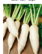
TURNIP Demi-long de Croissy 500 seeds £1.80 Sow: Jul - Sept