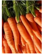
CARROT Little Finger 1000 seeds £1.80 Sow: Jul - Aug