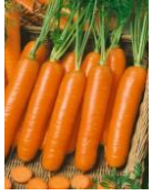
CARROT Amsterdam Forcing 1000 seeds £1.80 Sow: Jul - Aug