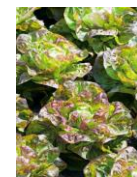
LETTUCE Brune d'Hiver 300 seeds £1.80 Sow: Jun - Sept