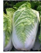
CHINESE LEAVES Wong Bok 200 seeds £1.80 Sow: Jul - Sept