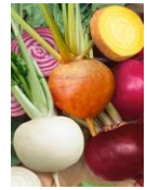
BEETROOT Mix't Colours 150 seeds £1.80 Sow: Jul - Sept