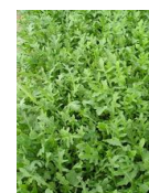
ROCKET Wild 500 seeds £1.80 Sow: Jun - Sept