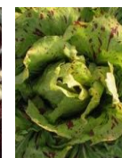
RADICCHIO Variegata de Castelfranco 300 seeds £1.80 Sow: Jun - Sept