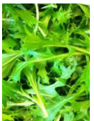
CHINESE MUSTARD Mizuna 200 seeds £1.80 Sow: Jul - Sept