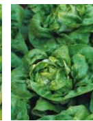
LETTUCE Arctic King 500 seeds £1.80 Sow: Aug - Sept