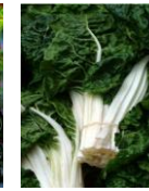
LEAF BEET Swiss Chard 150 seeds £1.80 Sow: Jul - Sept