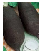
RADISH (Autumn) Black Spanish Long 200 seeds £1.80 Sow: Jul - Aug