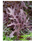
CHINESE MUSTARD Red Frills 200 seeds £1.80 Sow: Jul - Sept