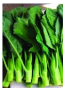
KAI LAN 200 seeds £1.80 Sow: Jul - Oct