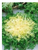
ENDIVE Green Curled Ruffec 300 seeds £1.80 Sow: Jun - Sept