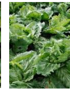
ENDIVE Encornet de Bordeaux 300 seeds £1.80 Sow: Jun - Sept