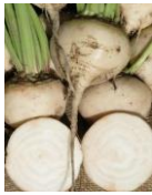
BEETROOT Albina Vereduna 100 seeds £1.80 Sow: Jul - Sept