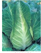
CABBAGE April 200 seeds £1.80 Sow: Jul - Sept