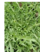
ENDIVE Fine de Louvier 300 seeds £1.80 Sow: Jun - Sept