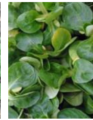
CORN SALAD Verte de Cambrai 300 seeds £1.80 Sow: Jul - Oct