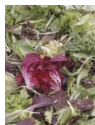
MESCLUN/MIX'T Mélange des 4 Saisons 500 seeds £1.80 Sow: Jun - Sept