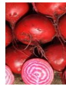
BEETROOT Tonda di Chioggia 100 seeds £1.80 Sow: Jul - Sept