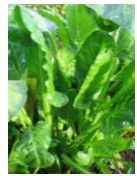
LEAF BEET Perpetual Spinach 200 seeds £1.80 Sow: Jul - Sept