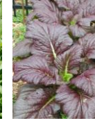
CHINESE MUSTARD Giant Red Mustard 200 seeds £1.80 Sow: Jul - Sept