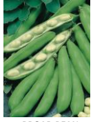
BROAD BEAN Aquadulce 30 seeds £1.80 Sow: Oct - Nov