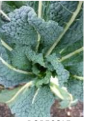
BORECOLE Nero di Toscana 200 seeds £1.80 Sow: Jul - Sept