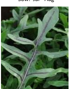
ROCKET Wild - Red Dragon 250 seeds £1.95 Sow: Jun - Sept