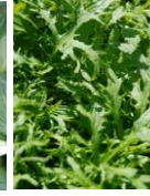
CHINESE MUSTARD Green Frills 200 seeds £1.80 Sow: Jul - Sept