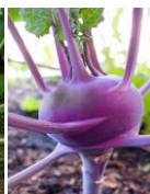
KOHL RABI Purple Vienna 300 seeds £1.80 Sow: Jun - Sept