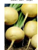
TURNIP Chivas' Orange Jelly 500 seeds £1.80 Sow: Jul - Sept