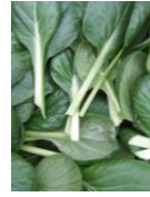
CHINESE LEAVES Taisoi 200 seeds £1.80 Sow: Jul - Sept