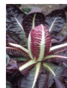
RADICCHIO Rossa di Treviso 300 seeds £1.80 Sow: Jun - Sept