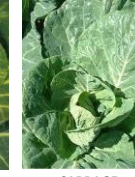
CABBAGE Wintergreen 200 seeds £1.80 Sow: Jul - Sept