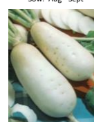
TURNIP Marteau/Jersey Navet 500 seeds £1.80 Sow: Jul - Sept