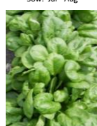
SPINACH Giant Winter 300 seeds £1.80 Sow: Aug - Sept