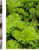
CHINESE MUSTARD Golden Frills 200 seeds £1.80 Sow: Jul - Sept