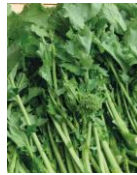
CIME DI RAPA Quarantina 200 seeds £1.80 Sow: Jul - Sept