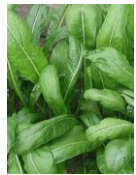
CHINESE MUSTARD Mibuna 200 seeds £1.80 Sow: Jul - Sept