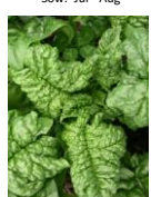
SPINACH Bloomsdale 300 seeds £1.80 Sow: Aug - Sept