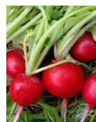
RADISH (Summer) Scarlet Globe 350 seeds £1.80 Sow: Jun - Sept